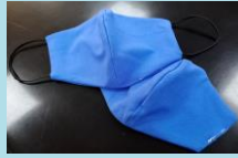
Cloth Face Masks

SAMPLE REQUIREMENT depends on the number and type of tests requested