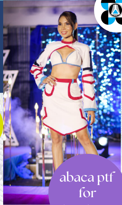
abaca ptf for streetwear

The Institute participated in the 2024 Regional Science, Technology, and Innovation Week (RSTW), and Abacanobasyon 2.0 in Bicol Region by conducting several activities such as an exposition, dialogue, forum, and fashion show. The exposition entitled "Abaca Textile Innovation Exposition" showcased the latest innovations of the Institute on Abaca Technologies.