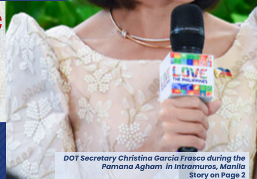
DOT Secretary Christina Garcia Frasco during the Pamana Agham in Intramuros, Manila Story on Page 2

27 August 2024, TELA Gallery, DOST-PTRI, Bicutan, Taguig City